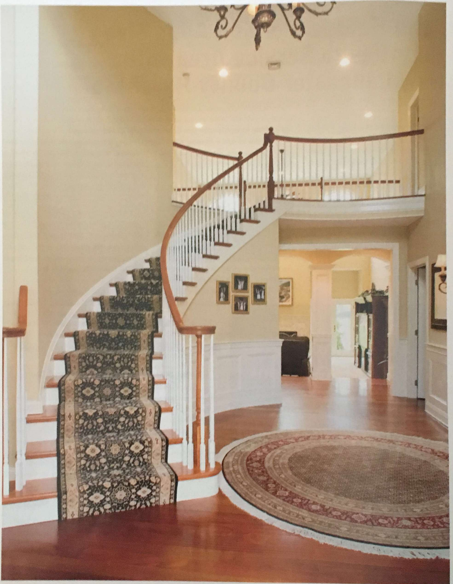
Stairs on the radius with natural finished treads and painted risers, hardwood floors, and chair-rail-height paneled walls, add to the drama in the foyer of the cover story home.