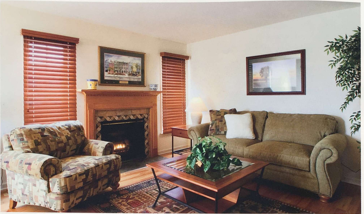
The cozy gas fireplace in the living room of this townhome in Cross Creek makes a comfortable spot to curl up with a good book. EXCAVATING SERVICES PROVIDED AT CROSS CREEK BY LEON WINTERMYER, INC., ETTERS, PA. CONCRETE WORK IN CROSS CREEK BY PEREZ'S CONCRETE, MIDDLETOWN, PA.