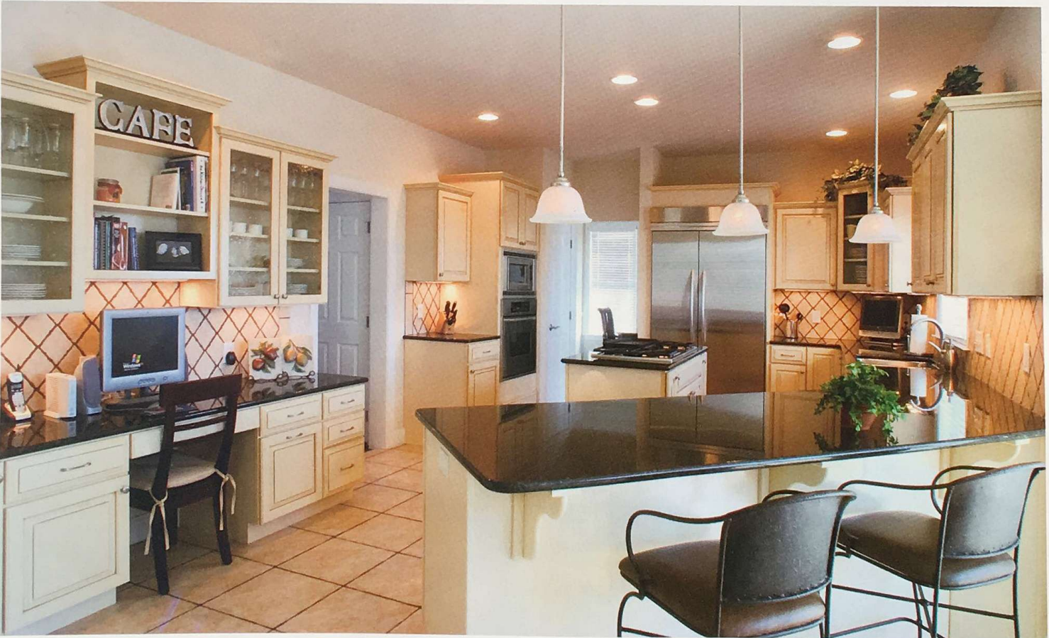
The antique finished cabinetry, granite countertops, island, and eat-in bar together with the ceramic tile floors and ceramic tile backsplash combine to create a truly special kitchen in a Classic Communities' custom home in Meadow View Estates.