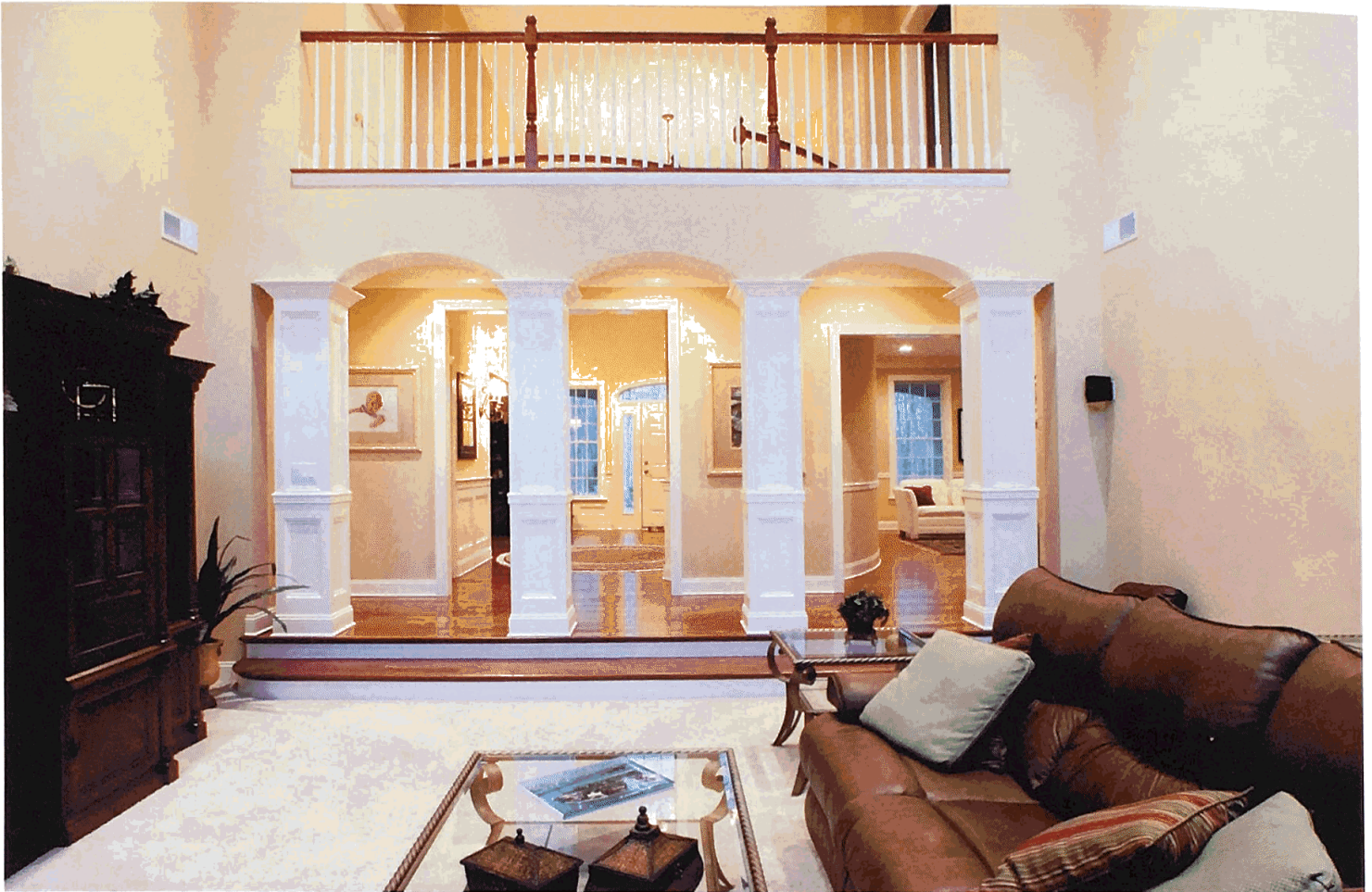
The view of the family room from the other direction, looking into the foyer, shows again the arches and columns from a different perspective, the loft, entry doors and attractive hardwood floors.

just off Route 15 and Route 114 toward Bowmansdale.